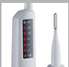
High contrast LED indicator