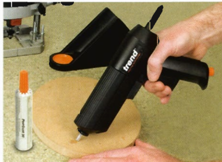
Trend cordless glue gun

A simple compression test using melamine-faced timber, chosen because