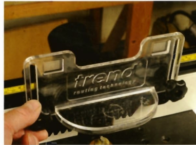
The clear plastic guard and the spring fingers co-locate on the same bolts, so a little juggling is required to set both