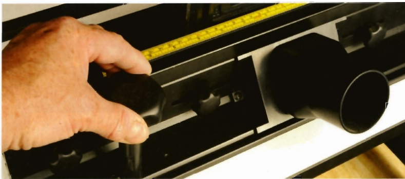
Once the lock knobs are undone, slide the fence backwards and off to the side, then you can lift the fence clear of the table for table routing with the lead-in pin only

although the adjustable rubber feet keep it from sliding around.