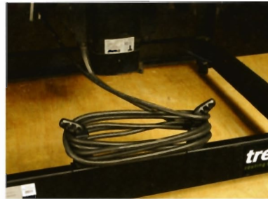
A neat idea that gets rid of the problem of surplus flex hanging down