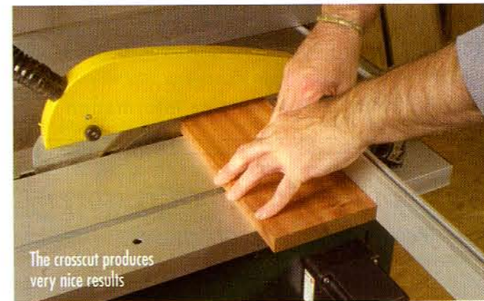
The crosscut produces very nice results

The sliding table works on four adjustable wheels and has a good clean action. To change the blade, the table needs to be partially removed. The fairly standard mitre fence is both adjustable and accurate.