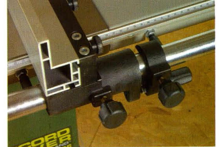
The fence is mounted on a good strong round bar and the fine adjuster is simple but effective