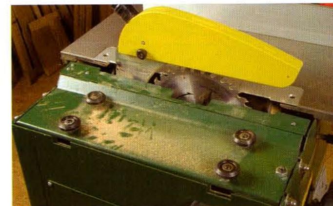
Blade changing is accessed by sliding the table off; note the wheels

Dust extraction is well catered for with both crown guard and lateral provision.