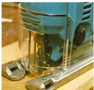
Good extraction with the visor down