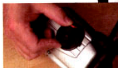
A dial selects three functions: standard drilling, hammer or breaking action