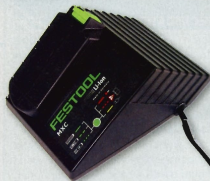
The battery charger is highly intelligent