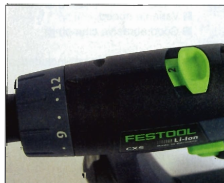
The speed and torque controls are clear