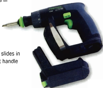
The compact battery slides in place below the front handle