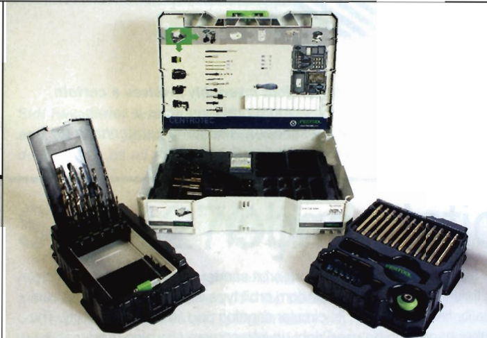
The accessory set fits in a Systainer case