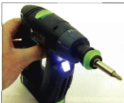
The LED work light is extremely bright