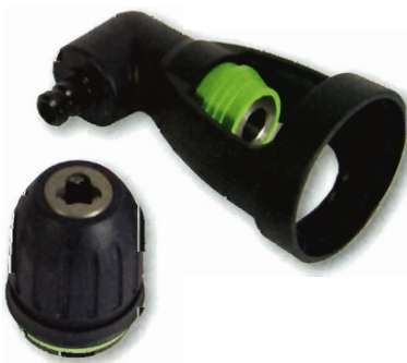
The right-angle adapter and chuck