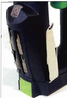
The magnetic holder stores spare bits