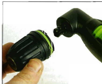
The chuck push-fits onto the adapter