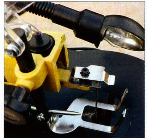
▲ ...while the flexible Anglepoise helps to make light work of sawing

a protective cover. Chuck diameter is 3mm. Like other saws, the blade still runs when using the flexible drive, so make sure that the plastic guard is in place. The guard's attached to a steel rod that also supports the bent steel hold-down. There's an adjustable dust blower pipe at the bottom, which needs a screwdriver to set. Alternatively, a 35mm port at the front of the