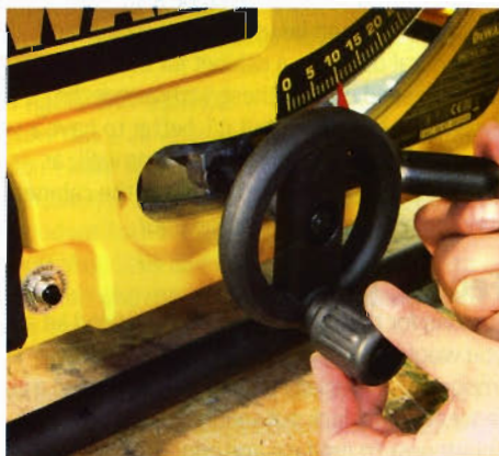
▲ Pic.2 To tilt the blade you unlock the lever. The wheel raises or lowers the blade