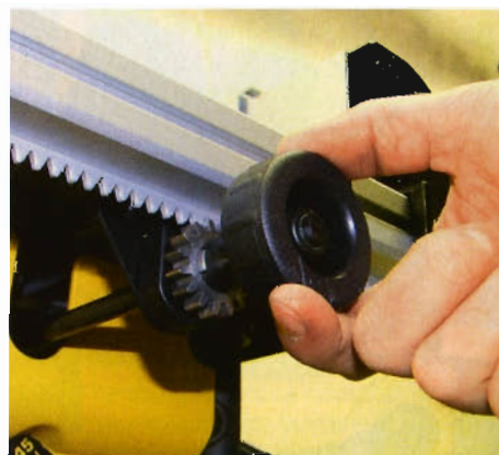
▲ Pic.3 You alter the fence position with this excellent rack and pinion wheel