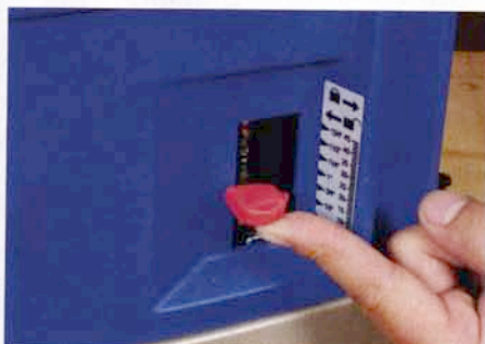
This neat device presets the finished height in 5mm increments from 5 to 45mm