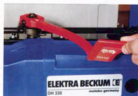
Locking the head keeps the cut uniform, although the thicknesser did show some snipe