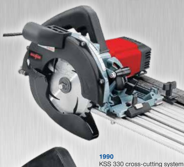
1990 KSS 330 cross-cutting system