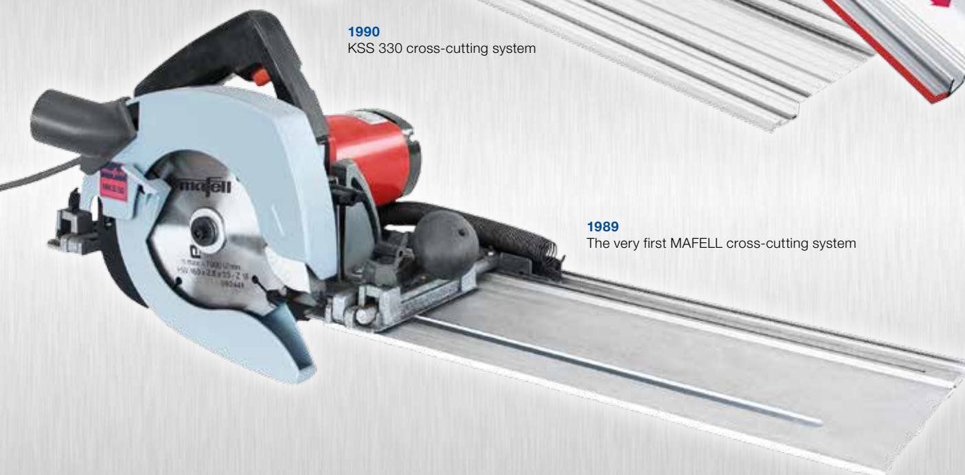
1989 The very first MAFELL cross-cutting system

Anyone using a MAFELL cross-cutting system quickly finds their day-to-day work unimaginable without the KSS. It's a tool that will not only transform your work, but also change you. See for yourself, and follow your instinct.