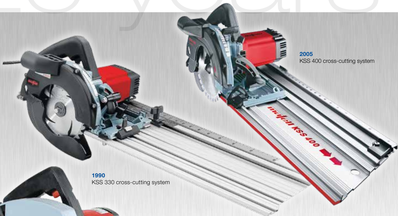
2005 KSS 400 cross-cutting system