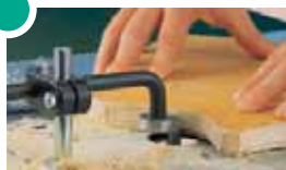
6115 000 Curved milling guide