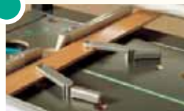
6176 000 Quick clamps