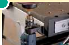
6152 000 Power tool holder