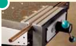
6171 000 Vice jaws