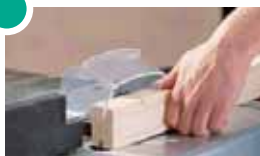
6114 000 Parallel milling fence